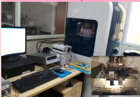
Gas Sensor Measurement System